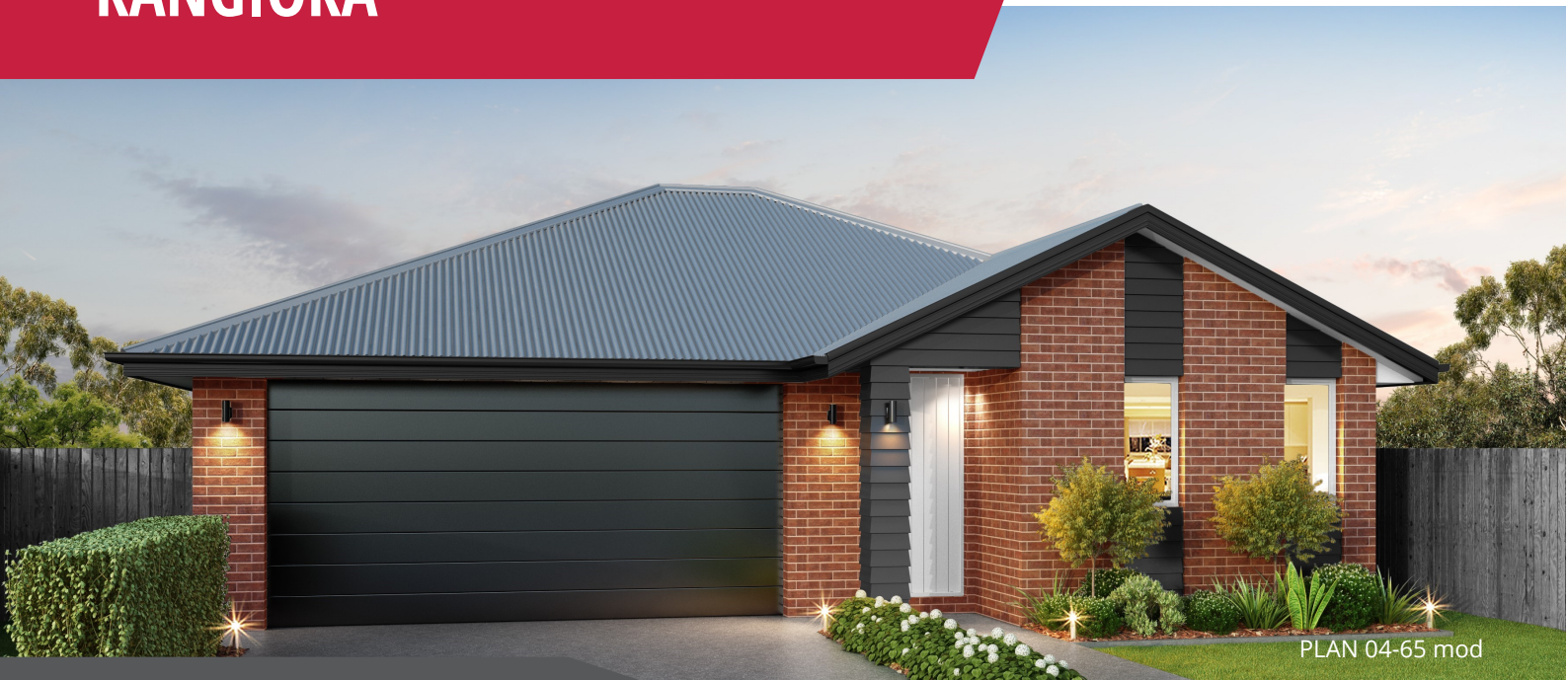
PLAN 04-65 mod